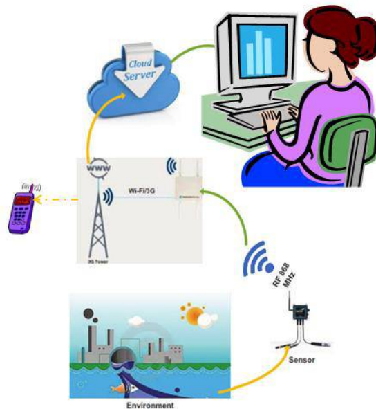
Fig: 1 Block Diagram

In this proposed architecture ,we are using microcontoller (ESP 8266) and it also has wifi router that is attached with it i.e moisture sensor, ultrasonic sensor,temperature sensor and humidity sensor at the field side connected to arduino node Mcu and output device is at the user side to view the action that performed by arduino based automatic plant watering system. Block diagram of the system is shown in the figure 1.