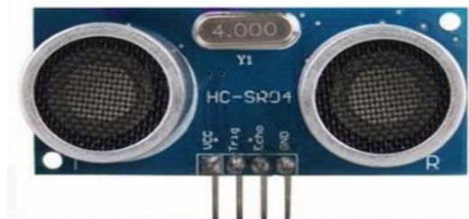
Fig 6: ultrasonic sensor

The HC-SR04 ultrasonic sensor uses sonar to determine distance to an object. It offers excellent non-contact range detection with high accuracy and stable readings. From 2cm to 400 cm or 1 to 13 feet. The operation is not affected by sunlight or black material like Sharp rangefinders are (although acoustically soft materials like cloth can be difficult to detect). It comes with a complete package of ultrasonic transmitter and receiver module