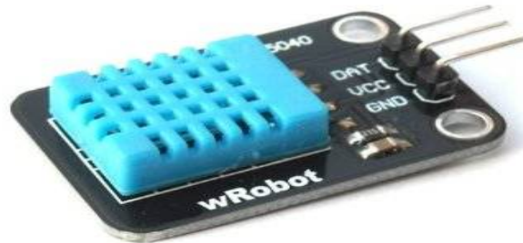
Fig 5: Temperature and humidity sensor